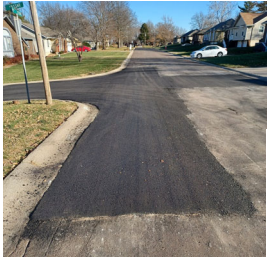
Asphalt Street Patching