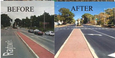
Pavement Marking Project